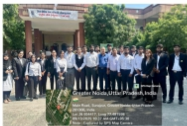
Lok Adalat visit - Surajpur Court