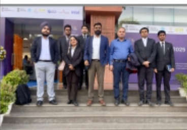
Dr. Ambedkar International Centre (DAIC), Visit Janpath, New Delhi